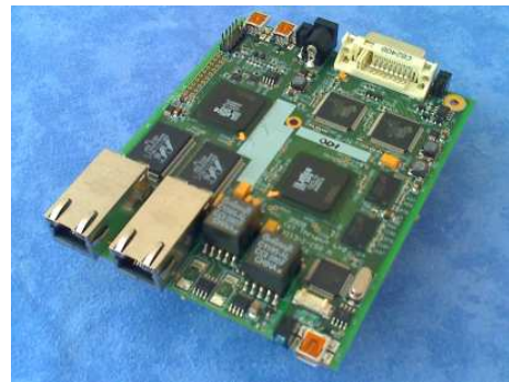
Sentinel CWP distribution uses independent modules for redundancy and flexibility. The system is infinitely scalable and deploys high-performance, low-power FPGA technology

This document is the copyright of the Thruput Limited. No material may be reproduced, copied, translated or modified without the express written permission of Thruput Limited. The Graphix Factory™ and TruePixel™ are trademarks of Thruput Limited. Thruput products are fully DVI compliant. Thruput Limited operate a policy of continuous improvement and information in this website is subject to change without notice and does not constitute an Offer or a Warranty of any kind.