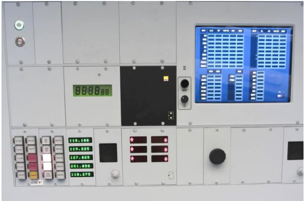
Top left: The console mounted switch of the GF 1030 SW has colour coded, console mounted switches: