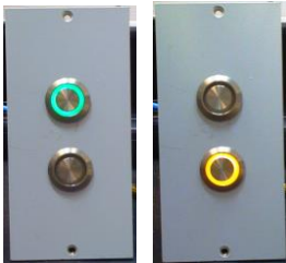
Left: Main System (green). Right: Backup system (amber).