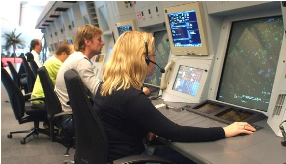
LVNL, the Netherlands Air Navigation Service Provider operates the Area Control Centre at Schiphol.

As part of the on-going investment at Schiphol ATC Centre, LVNL, the Netherlands Air Traffic Service provider have selected the Thruput multipurpose switch solution to enable seamless operation between their existing Main and new Backup ATC systems.