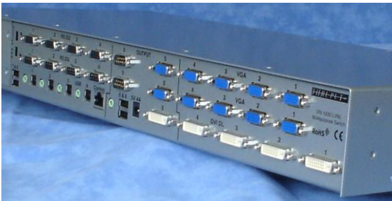
Front view of the GF 1030 SW multipurpose switch.