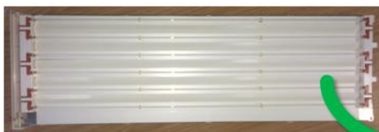
Legacy CCL (Cold Cathode Lamp)

Restore as-new brightness and re-life the display