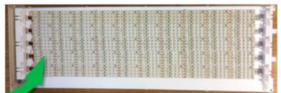
Backlight Update Service LED (Light Emitting Diode)

Restore as-new brightness and re-life the display